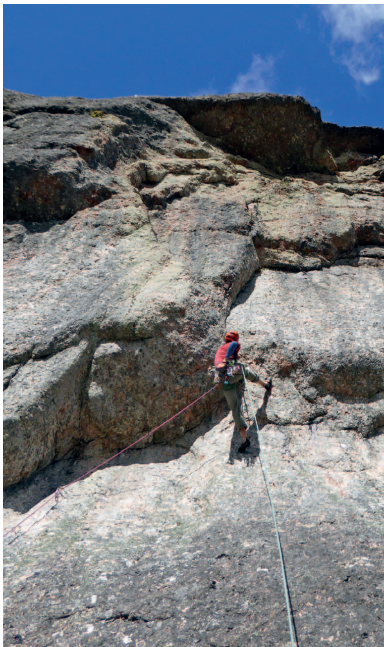
Murdoch Jamieson on the 2nd ascent of Isinglas (E8), Binnein Shuas.