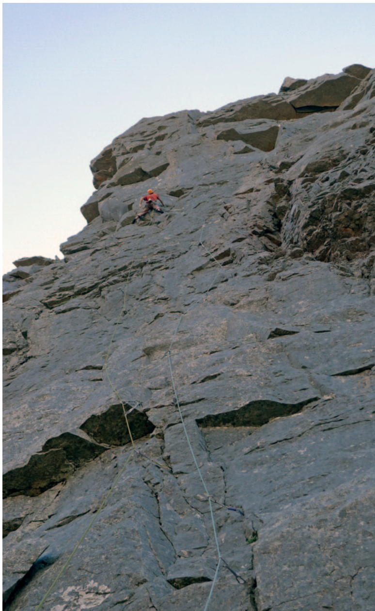
Iain Small on the FA of Fascist Groove Thang, Direct Start (E5,6b), Beinn Eighe.