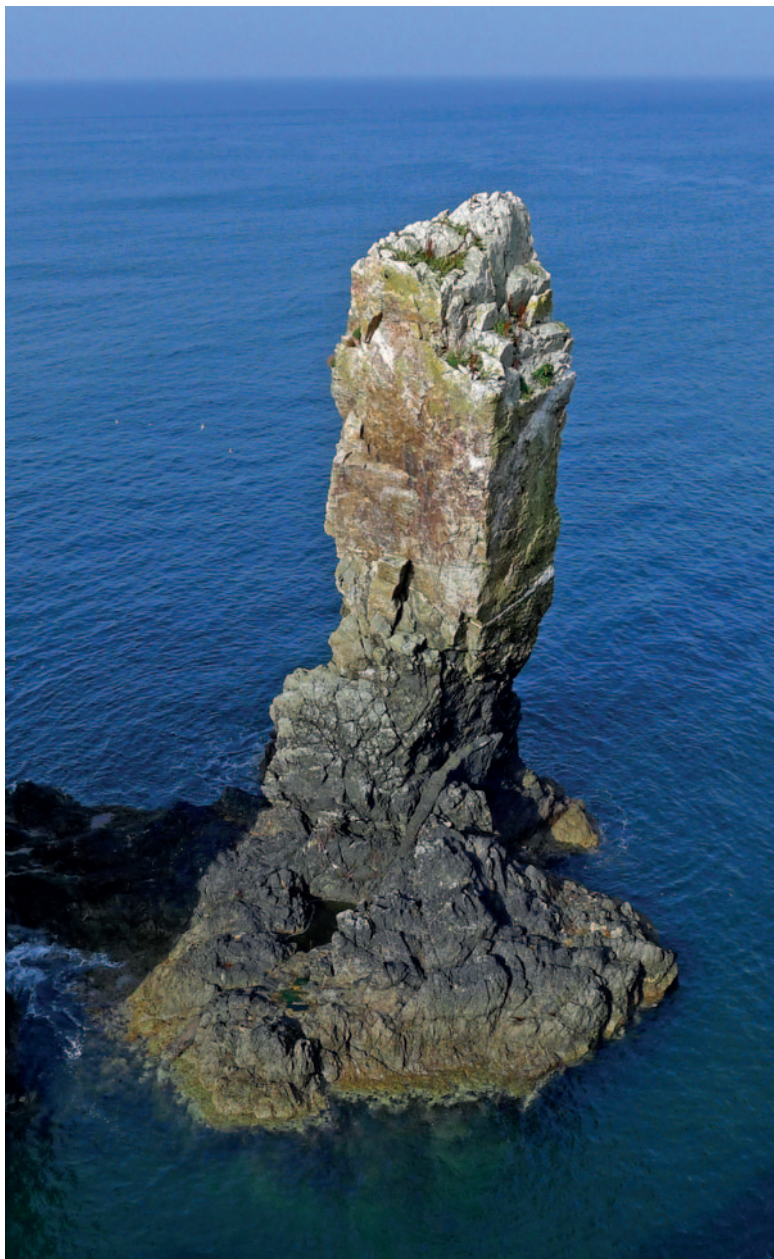
Creag an t-Saighdeir, Islay.