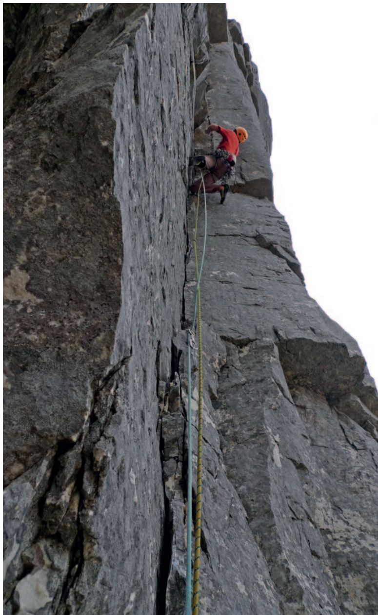
Iain Small on the 2nd ascent of New World Order (E6,6b), Beinn Eighe.