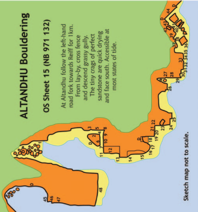
Sketch map not to scale.

The tiny crags of perfect sandstone are quick drying and face south. Accessible at most states of tide.