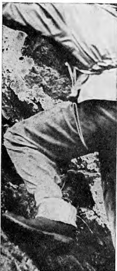
Abseiling on Shepherd's Crag, Borrowdale.

A p.c. to Wm. Timpson Ltd., Great Ducie Street, Manchester, 3, will bring you a fully illustrated catalogue.