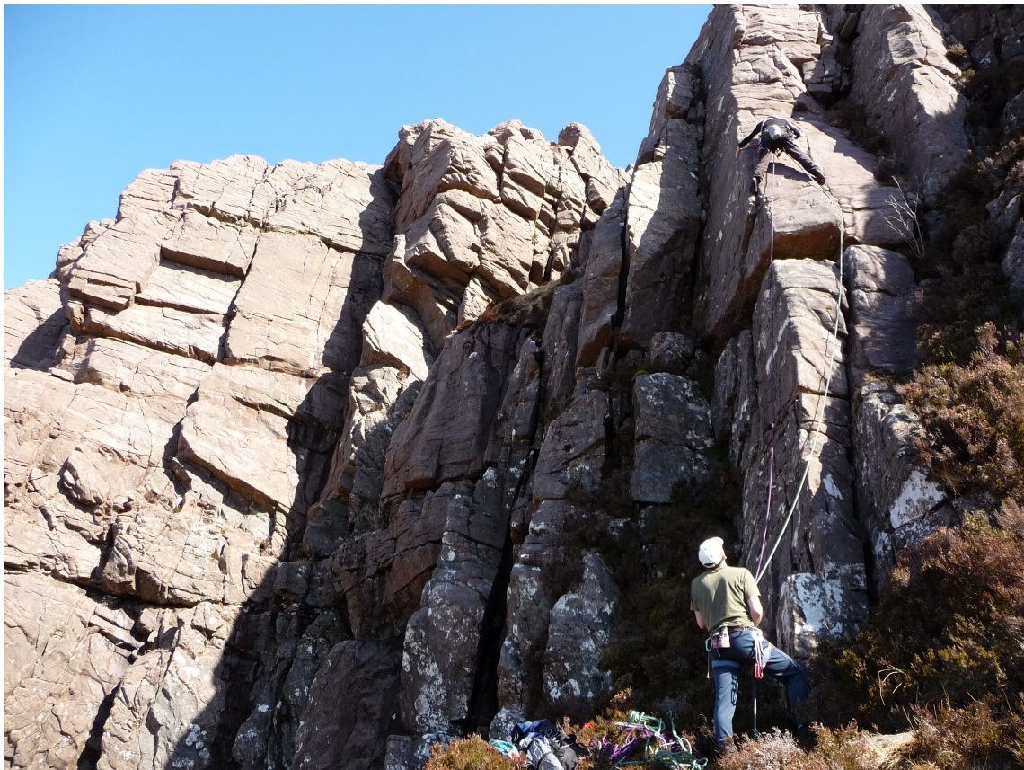
Simon Clark on the first ascent of Sedgehog (VS). Main Hidden Wall is in the sun on the left.

Start 20m to the right of Sedgehog. Go up an easy crack on right side of a black water mark to reach a steeper crack splitting an arête above. Follow this to the top.