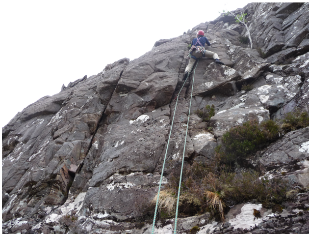
First ascent of Right Crack Climber Dave Porter

Brown Wall Moving west, the crag line is 'interrupted' by a much browner, easy-angled sandstone section 30m wide. (no routes)